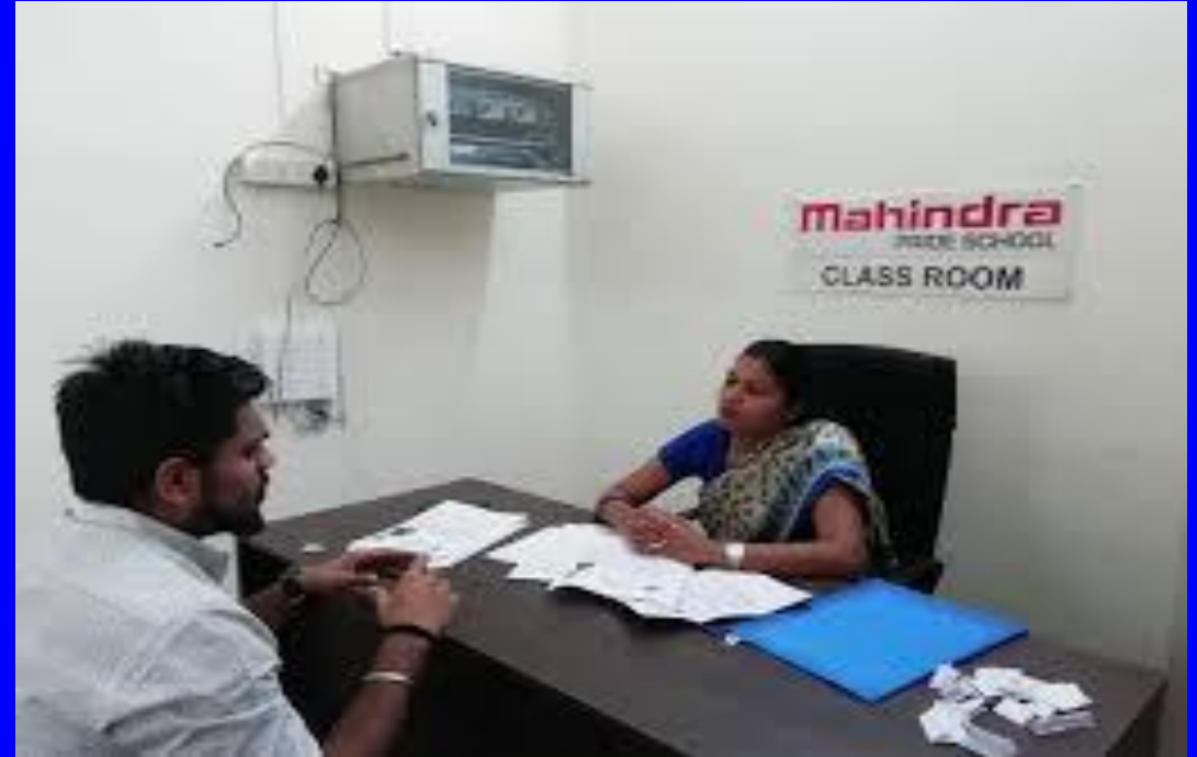
Personal Interview (PI)