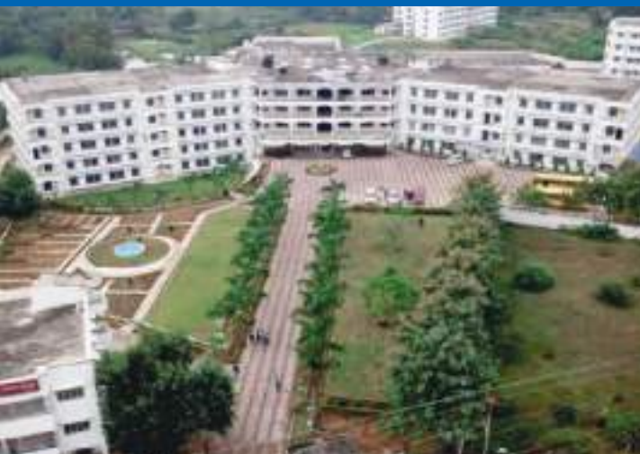
Drone View of the Campus