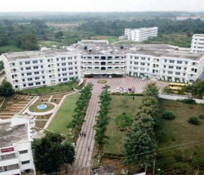
Drone View of the Campus