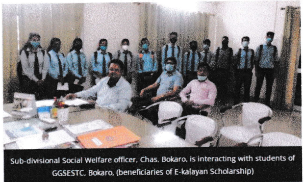
Sub-divisional Social Welfare officer, Chas, Bokaro, is interacting with students of GGSESTC, Bokaro, (beneficiaries of E-kalyan Scholarship)

DIRECTOR GGSESTC, Kandra, Chas Bokaro, Jharkhand-827013