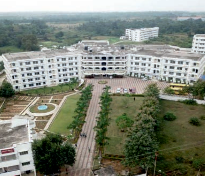
Drone View of the Campus